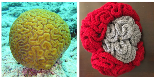
The Beauty of Hyperbolic Geometry With NewSpace New Mexico

Live streamed events are scheduled throughout Science Fiesta week (September 18-26). These live, interactive presentations will bring scientists – and their science – to your classrooms and students. Students will have the opportunity to ask questions, learn something new, and engage with real scientists.