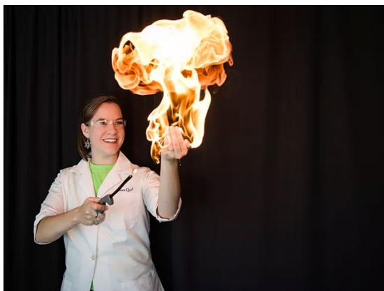
Performing with fire Science Girl's Lab

Live streamed events are scheduled throughout Science Fiesta week (September 18-26). These live, interactive presentations will bring scientists – and their science – to your classrooms and students. Students will have the opportunity to ask questions, learn something new, and engage with real scientists.